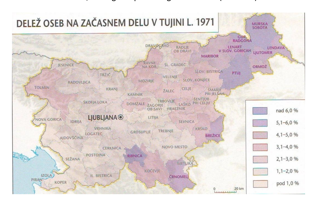
Picture 1: Goričko Region with the highest percentage of people temporarily working abroad, 1971

Increasing unemployment affected greater migration flows and changing of demographic picture. The most difficult regions for finding employment were agrarian areas, which caused people from the areas to look for jobs abroad. To affect the trend of permanent or temporary migration (immigration) Slovenian authority defined a measure to speed the development of less developed areas of Slovenia in 1971. As such were considered eleven municipalities, mostly on the periphery of the Pannonian Basin. The promotion of investment in employment in these areas didn't show any results and consequently most of the job seekers in foreign countries came from these areas (Slovenski zgodovinski atlas 2011: 203). In Goričko Region, the share of people looking for employment abroad was over 6%, the highest percentage in Slovenia (Picture 1).